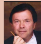
Gerard Schwarz , Conductor Orchestra Seattle Symphony Seattle, Washington

MENC All-Northwest Band MENC All-Northwest Orchestra